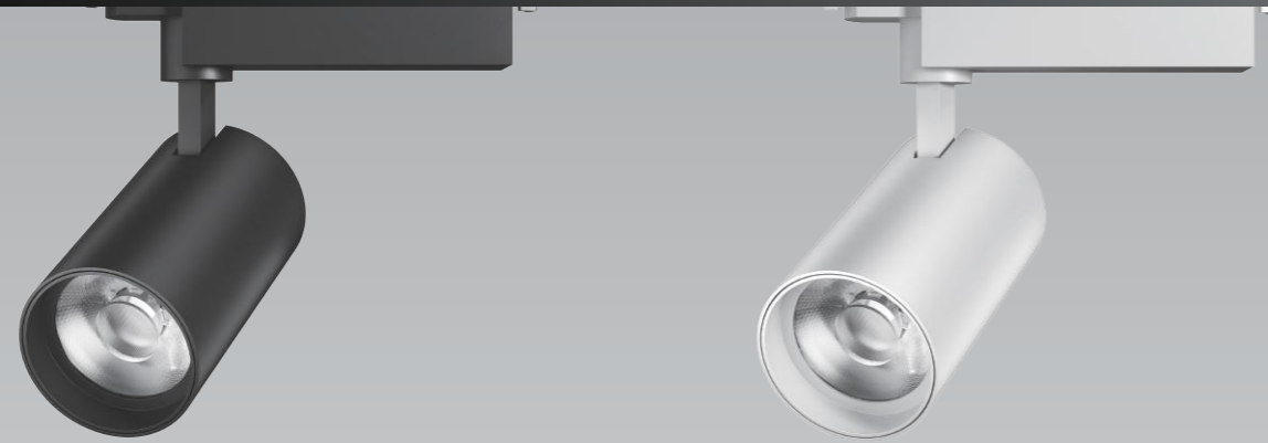
K-T3-A-80 Power:25W/30W Diameter:80mm